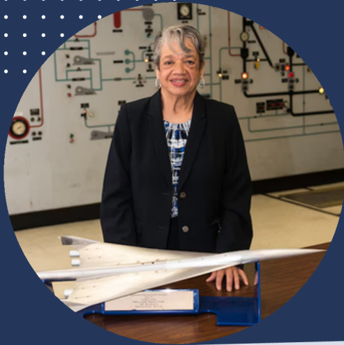
Dr. Christine Mann Darden

Dr. Christine Mann Darden is internationally known for her research into supersonic aircraft noise, especially sonic boom reduction, and is recognized for her groundbreaking achievement as the first African American woman at NASA Langley to be appointed to the top management rank of Senior Executive Service. She is equally known for her efforts to inspire and educate generations of aerospace scientists and engineers.