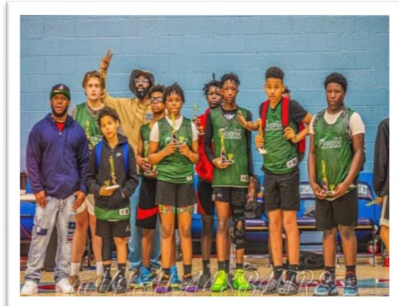
2023 Monroe 13U All-Stars Team runner-ups

The Youth Track and Field registration deadline is March 31, 2023. Registration can be found online or by clicking here .