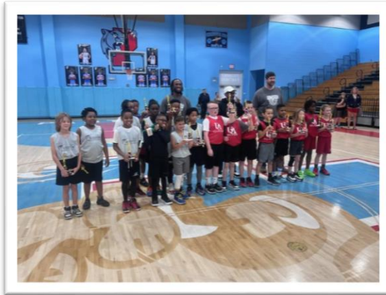
2023 Monroe 9U All-Stars Team runner-ups

The Monroe Parks and Recreation Department had the opportunity to send a total of seven all-stars teams to the Union County All-Stars Youth Basketball Tournament from February 21-26, 2023 at various gym locations throughout Union County. As a result, the Monroe 9U age division and Monroe 13U age division teams were awarded runner-ups.