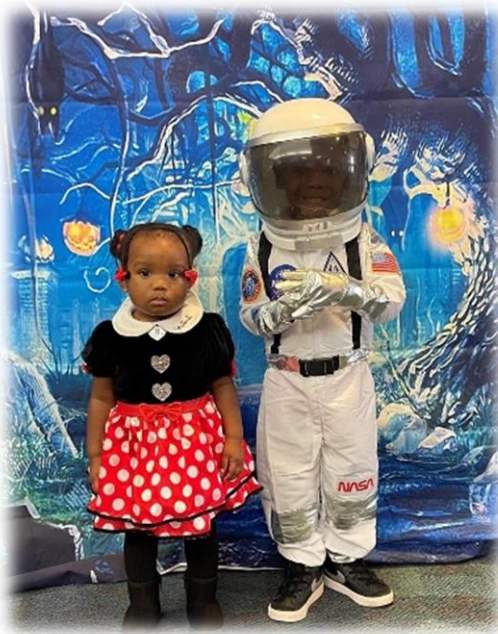
Astronaut and Minnie Mouse