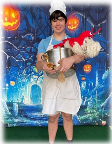
Funniest: Steamed Lobster