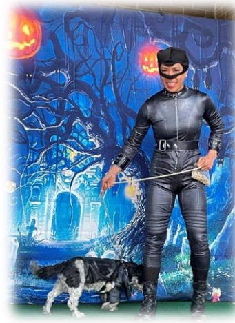
Best Owner/Pet Combo: Cat Woman and Batman