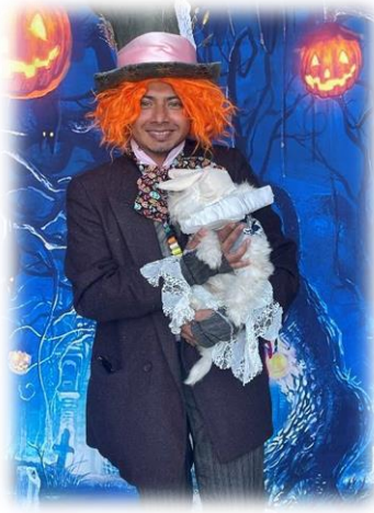
Best Overall: Mad Hatter and the Rabbit