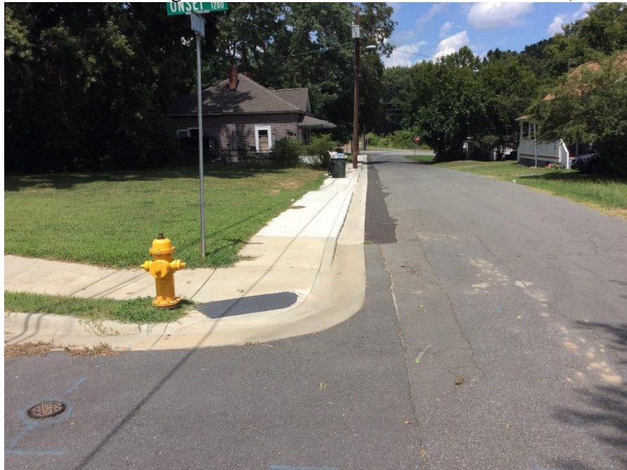
Guild Street looking from Onset Place towards Jefferson Street now