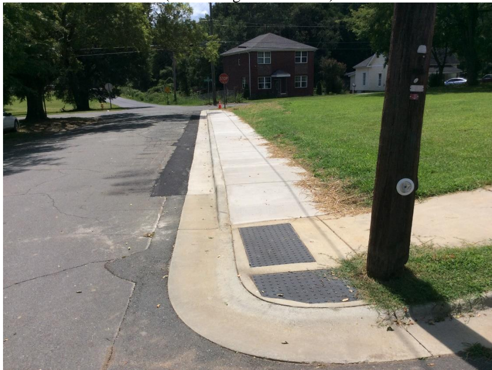
Guild Street looking from Onset Place towards Icemorlee Street now