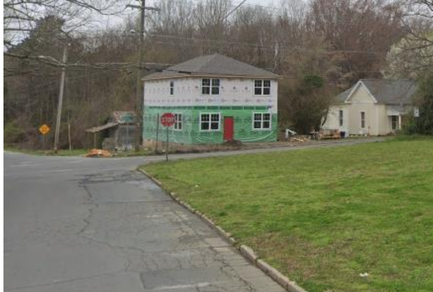
Guild Street looking from Onset Place towards Icemorlee Street (before) (from Google Street view)