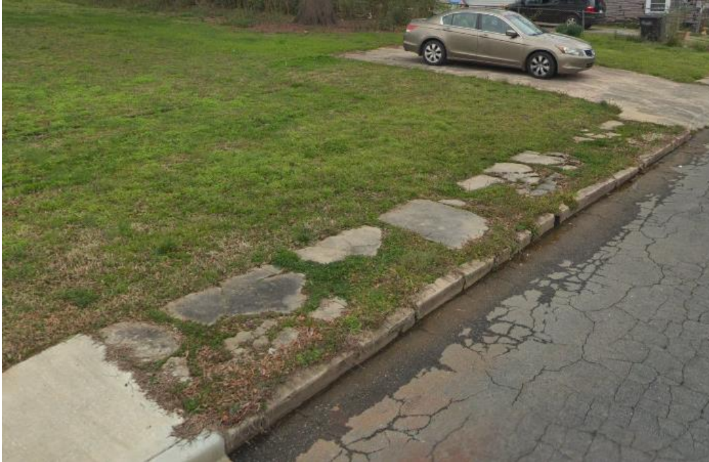
Guild Street looking from Onset Place towards Johnson Street (before)