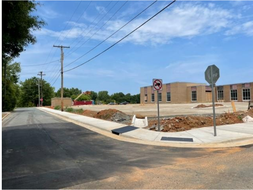
College Street looking from Jefferson Street now

The Street Division also installed a cul-de-sac on Kempars Lane. Residents had previously requested a cul-de-sac once the Union County Public School buses stopped picking up students along the length of the street. Before and after pictures are below. The installation of the cul-de-sac should allow the buses to resume servicing along the length of the street.