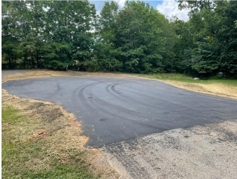
Kempars Lane now