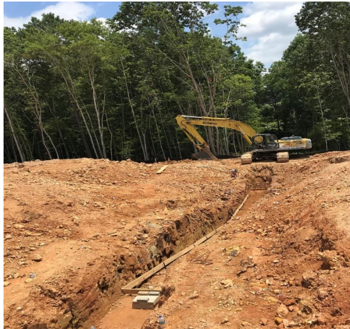
South wall of EQ Basin