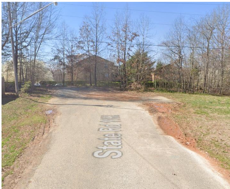
Previous view of the dead end on Kempars Lane

The Street Division also installed a cul-de-sac on Kempars Lane. Residents had previously requested a cul-de-sac once the Union County Public School buses stopped picking up students along the length of the street. Before and after pictures are below. The installation of the cul-de-sac should allow the buses to resume servicing along the length of the street.