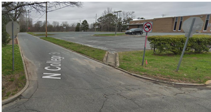
College Street looking from Jefferson Street before

The Street Division recently completed two larger scale projects. New curb and gutter with sidewalk has been installed along College Street between Jefferson Street and Crowell Street. This completes the sidewalk loop that is being installed around the new Senior Center and Parking Lot. A portion of College Street was also resurfaced to ensure positive drainage through the intersection. Please see the before and after pictures below.